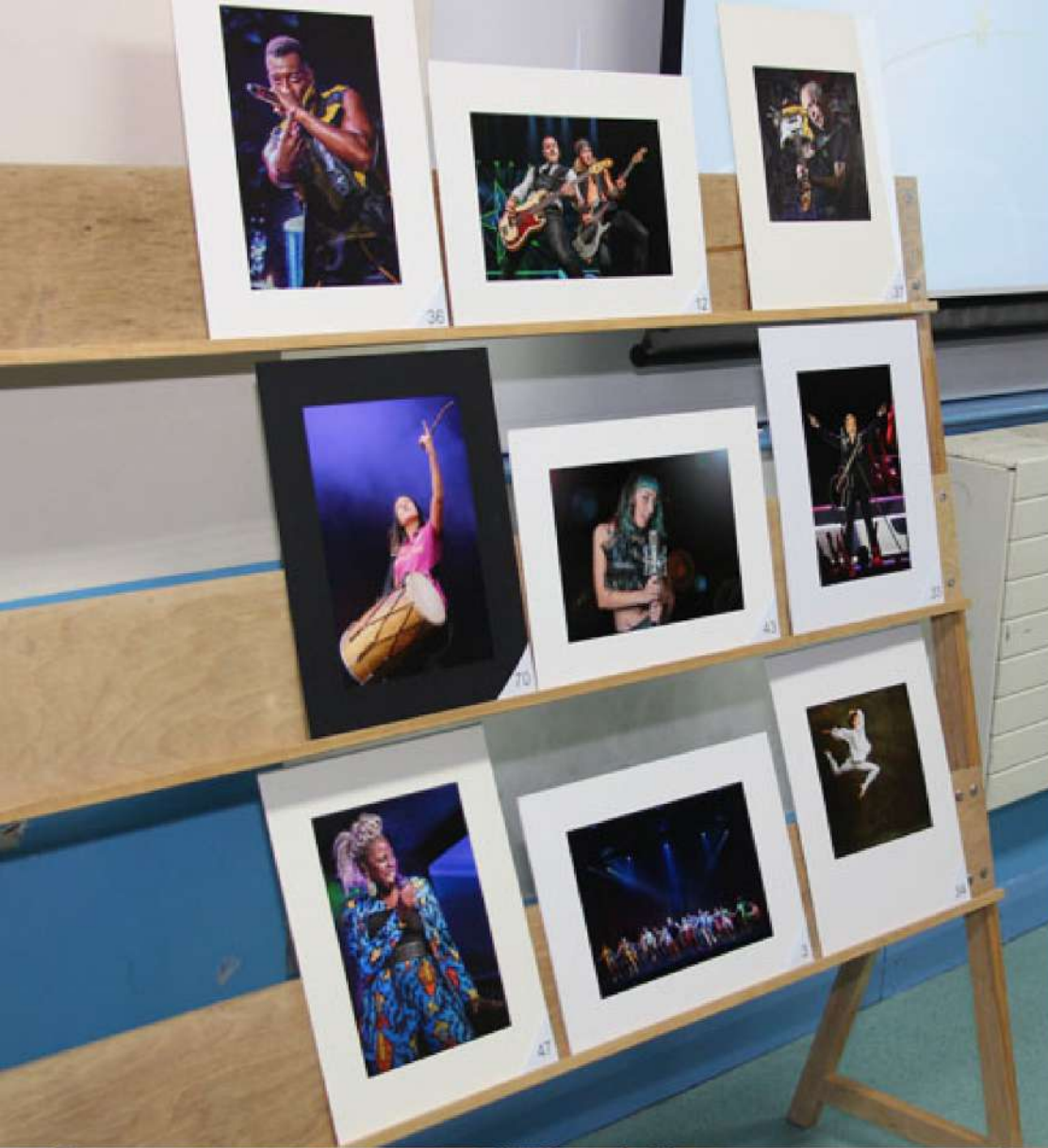
Colour Prints - Starred Images