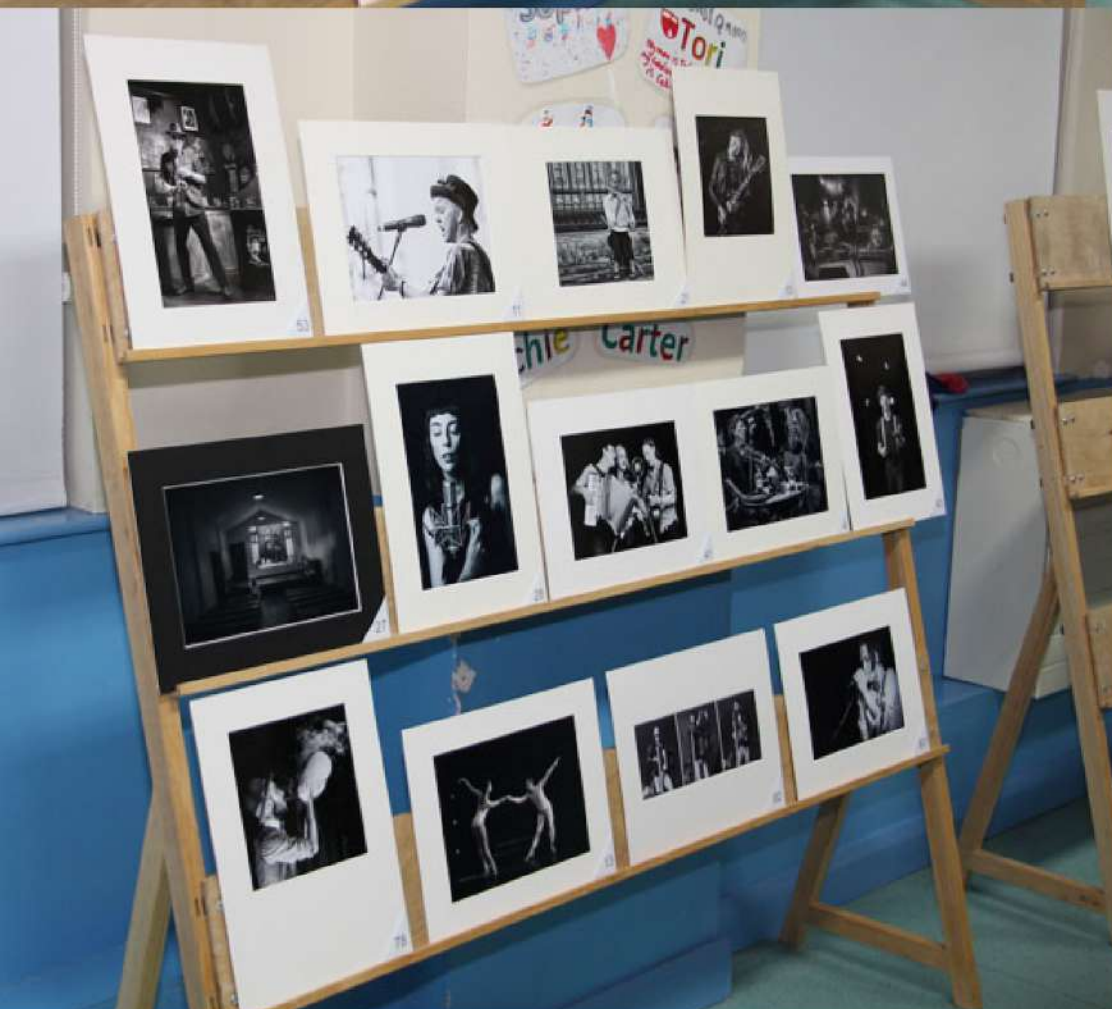
Mono Prints - Starred Images