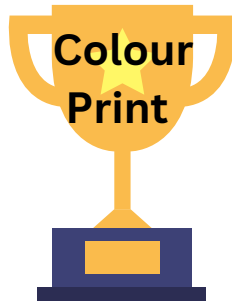
Gougane Barra