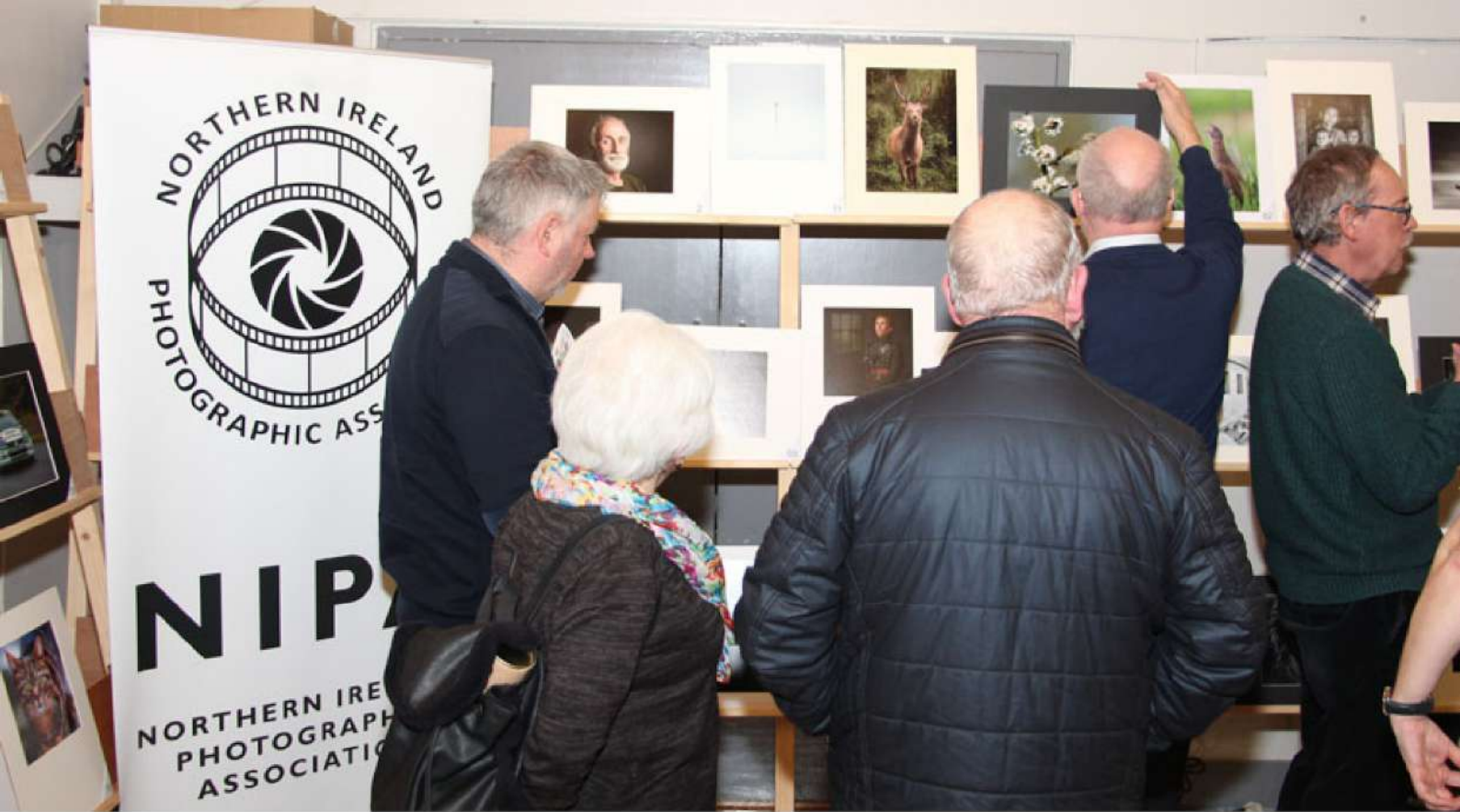
Club members checking out the Colour prints on display