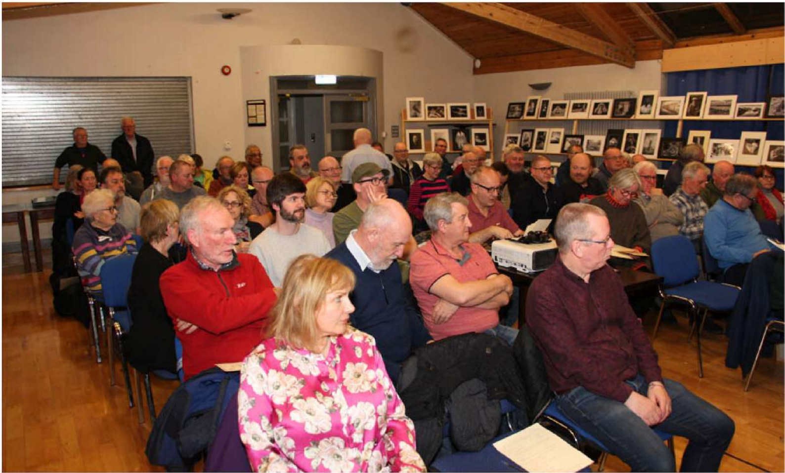
A packed room for Round 5 results.