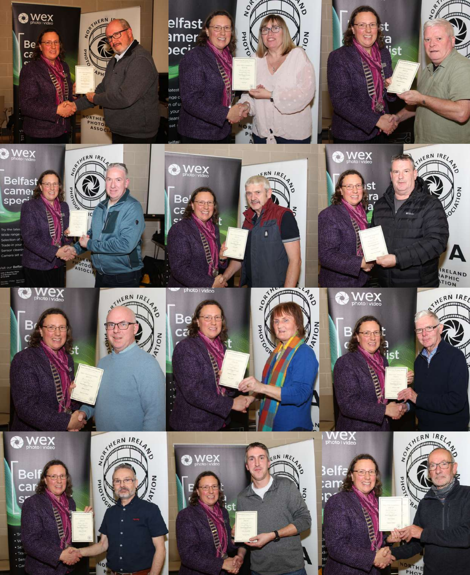
Well done to all members gaining stars and receiving vouchers.