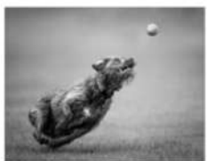
6 Locked and Loaded - Jennifer Willis.tif