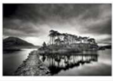
1 The Island - Roger Eager.jpg

The IPF Club Championship trophy sits nicely alongside Top Club in the PAGB Club Championships. Quite some achievement. Congratulations Catchlight!