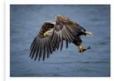
10 White Tailed Sea Eagle - Ross McKelvey.jpg

LIPF AIPF FIFP LRPS ARPS FRPS CPAGB DPAGB MPAGB