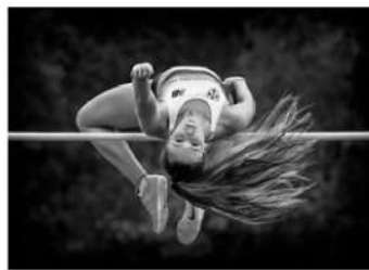
6. Up And Over Score 23