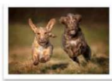
7 Double Trouble - Jennifer Willis.jpg