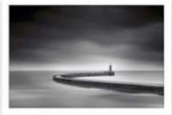
5 Roker Pier - Roger Eager.jpg