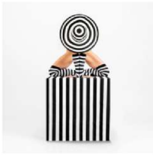
1. Stripes Score 28