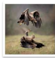
4 fighting white tailed eagles - Pamela Wilson.jpg