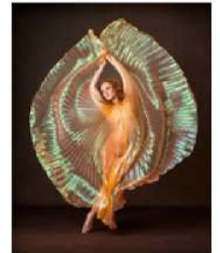
8. Wings Of Iridescence Score 21