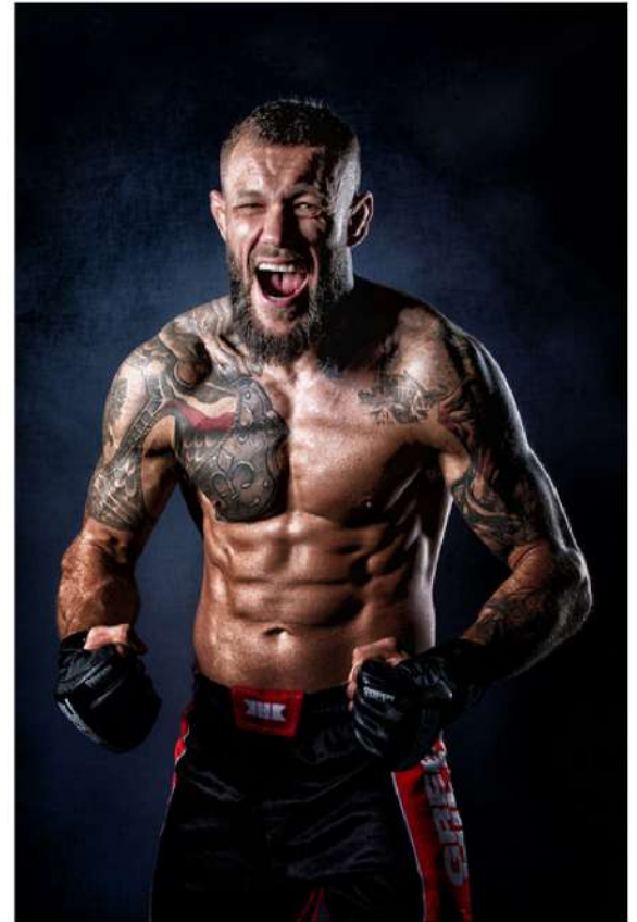
Don't mess with me! - scored 27/30 One man, three vices 19/30

This was a wonderful experience that reminded me that whatever you put your mind to you can achieve.