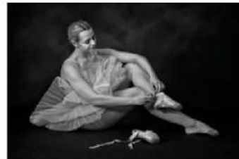
11. After The Ballet Score 23