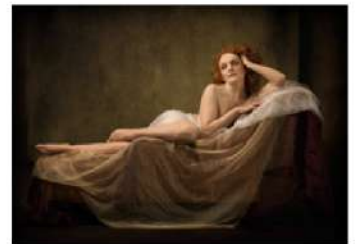
12. Repose Score 24