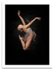
1 Frozen Jump - Ross McKelvey.jpg