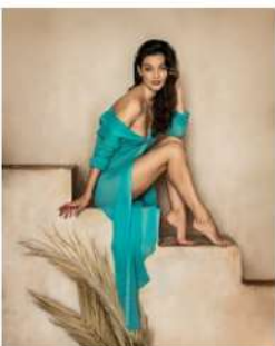
13. The Steps Score 18