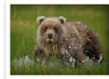
9 Alaskan Coastal Bear Cub - Pamela Wilson.jpg