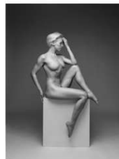
15. The Thinker Score 24