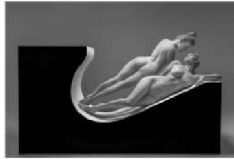
2. YinYang Score 21