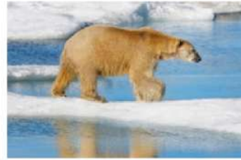
7. Polar Bear March Score 20