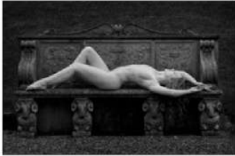
5. Carvings And Curves Score 26