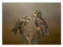
6 Pairing Off Laurie Campbell.jpg