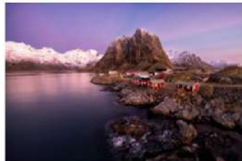
10. Hamnoy Sunrise Score 17