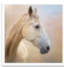
2 Blonde Gelding - Laurie Campbell.jpg