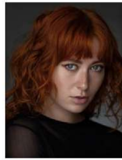
3. Eye Catching Score 20