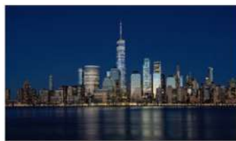
14. Empty Sky Score 15