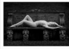
4 Carvings And Curves - Tony Mulvenna.jpg