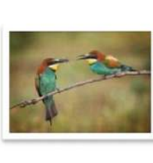
3 Bee Eater Gift - Jill Crockett.jpg