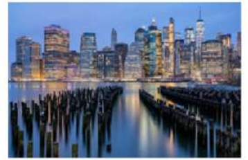
4. BrooklynNights Score 22